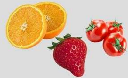
Coarse filter for texture juice